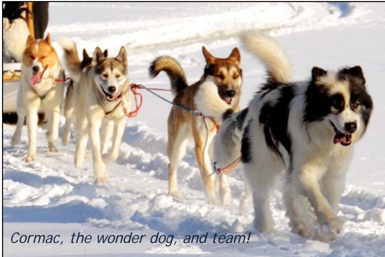
Cormac, the wonder dog, and team!

The fall colors are past peak and the ground is becoming covered with beautiful shades of orange, brown, faded red, and yellow leaves. It is fun to walk the puppies in the woods at this time of year and see them play in all the new "toys" that have fallen from the sky. Snow is coming to the mountaintops that surround us in the Bear River Valley and eventually will be at our doorstep. That means it's time to hook up the dogs up for some exciting runs!