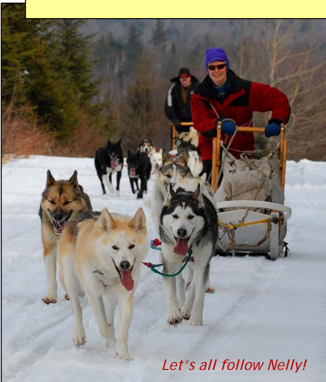
Let's all follow Nelly!