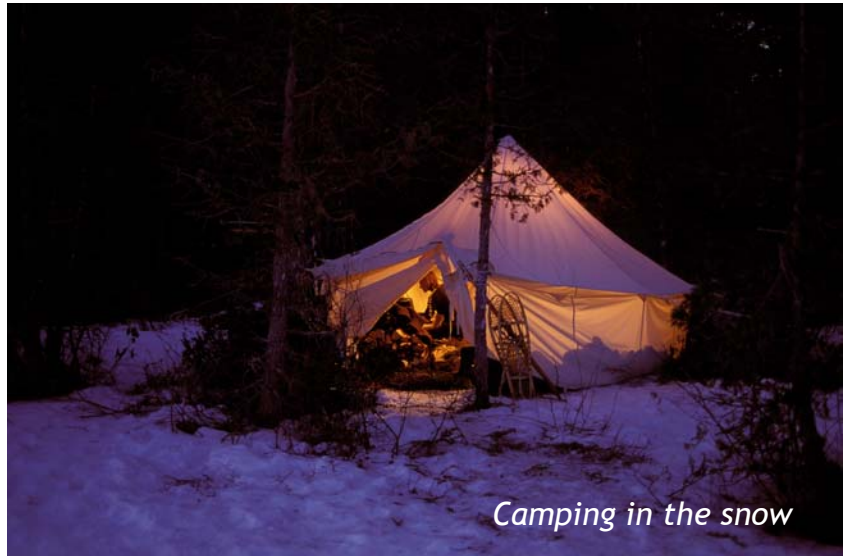
Camping in the snow

Our cold weather in January thickened the ice a lot on Umbagog Lake. When we're at camp, we're now breaking through about 20 inches of ice for water. It's very satisfying once we hit water and it gushes through the hole.