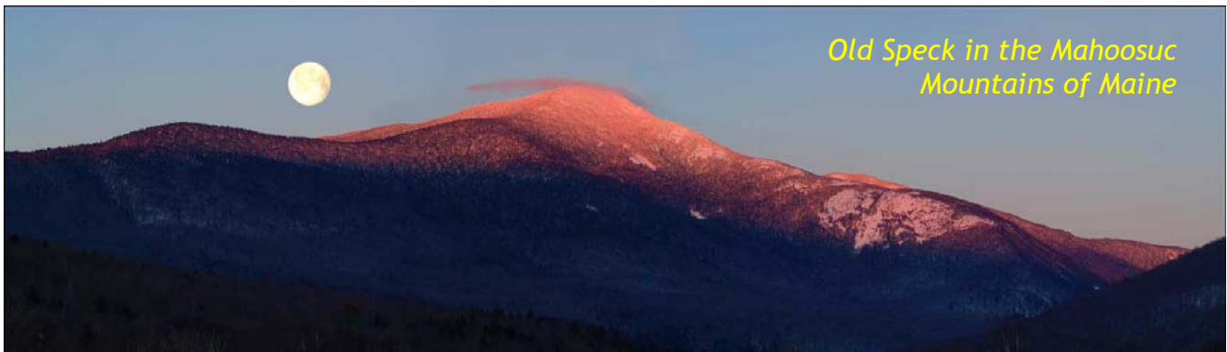
Old Speck in the Mahoosuc Mountains of Maine