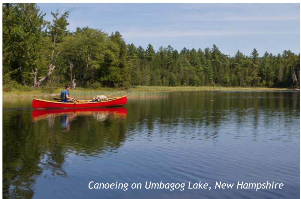
Canoeing on Umbagog Lake, New Hampshire